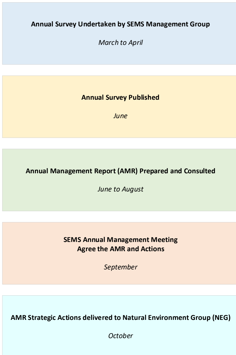
Figure 1. Solent Marine Sites Management Scheme Framework

The overall MS components include an Annual Survey, an Annual Management Report, an annual meeting of RAs, consultation with strategic stakeholders and agreed actions. These outputs are supported by the SEMS website, this provides more detailed resources and guidance. Figure 1 shows the annual timetable.